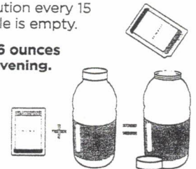
Bottles and packets not shown actual size.

IMPORTANT: If nausea, bloating, or abdominal cramping occurs, pause or slow the rate of drinking the solution and additional water until symptoms diminish.