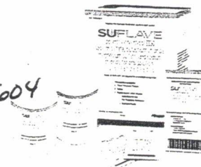
Bottles and packets not shown actual size.

SUFLAVE™ (polyethylene glycol 3350, sodium sulfate, potassium chloride, magnesium sulfate, and sodium chloride for oral solution) 178.7 g/7.3 g/1.12 g/0.9 g/0.5 g